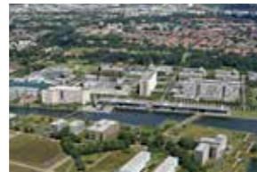
埃因霍温高科技园区 High tech campus Eindhoven