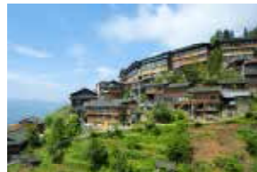
传统山村 Traditional mountain village