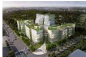
万科生态花园 Vanke Eco Garden Offices